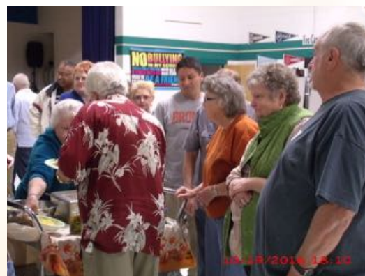
Winners of the ChiliCookOff 2016