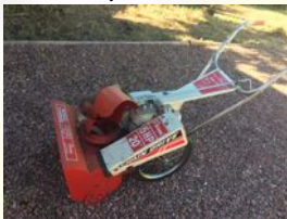
Early 60's Parmi Single Stage Snow Thrower

New Article Section - Hobbies and Collections! Pages 8-9 This item belongs to James Pesicka Please share yours with us!