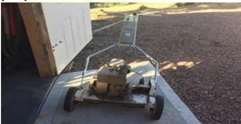
60's Montgomery Wards Garden Mark Self-propelled Reel Mower